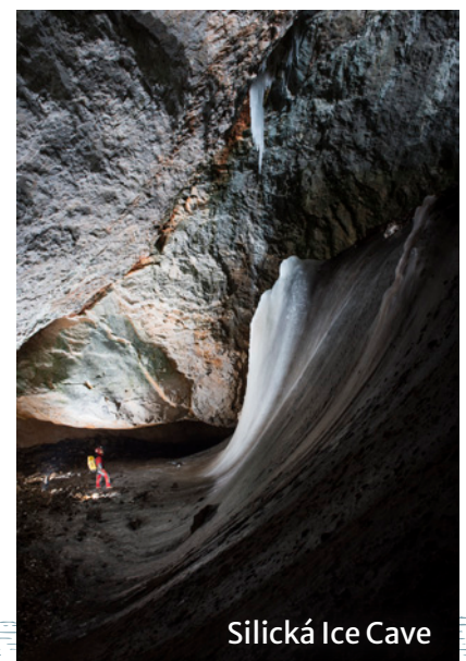
Silická Ice Cave