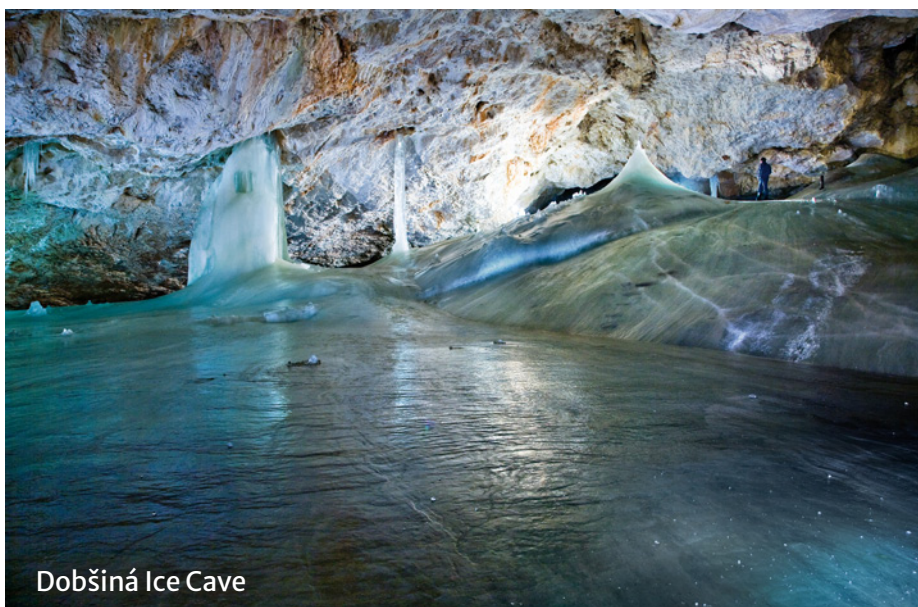
Dobšiná Ice Cave

08.30 – 18.00 Post-excursion to the Havrania Abyss (Ohnište, Low Tatras). Field clothes, light, and helmet necessary. 2-hour walk with 0,5 kilometers vertical ascent between the parking and the abyss. Vertical descent in the abyss through a ladder (15 m depth).